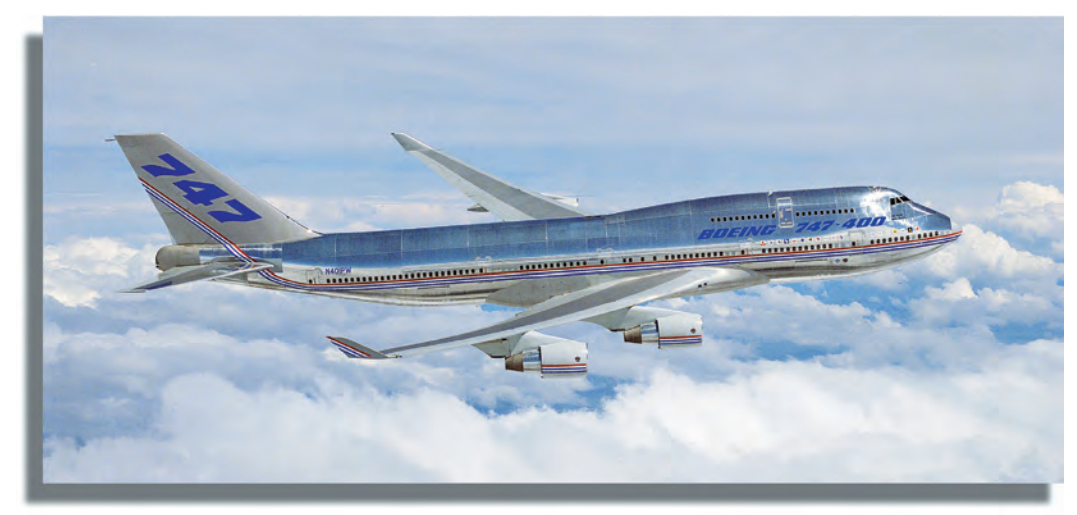
The Boeing 747

This is the largest commercial airliner ever built and it deserves the name jumbo jet. There have been about 700 of the giant Boeing 747s built in 15 models. The 747-100 and 747-200 have been produced in