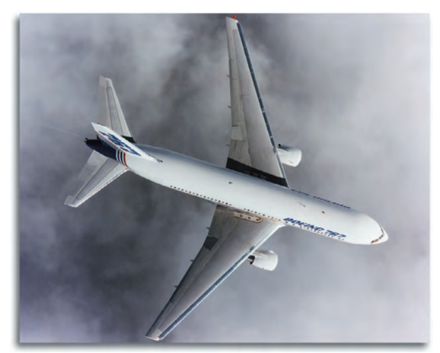
The Boeing 767-200

The 767 is a twin-engine, wide-body jetliner, but it is not as wide as the 747. The 767 fuselage is 15 feet wide compared with 20 feet for the 747. The tourist-