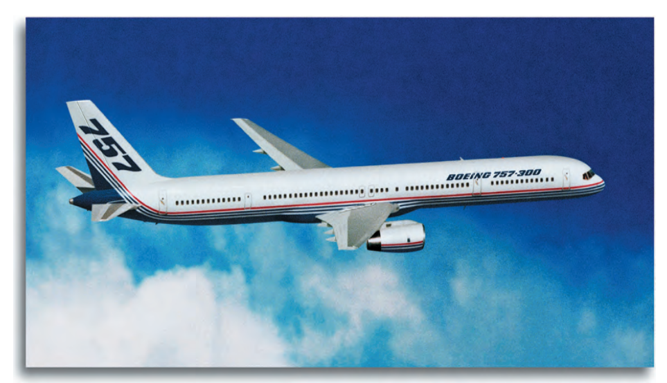
The Boeing 757

Savings with the 757 are not limited only to fuel. The 757 is certificated for a two-crew member operation, whereas the 727s they replace are all operated by three crewmembers. This factor can result in a $9 million per year savings for a 10-aircraft fleet. New, lower-maintenance systems can save the same 10-aircraft fleet an additional $2 million per year.