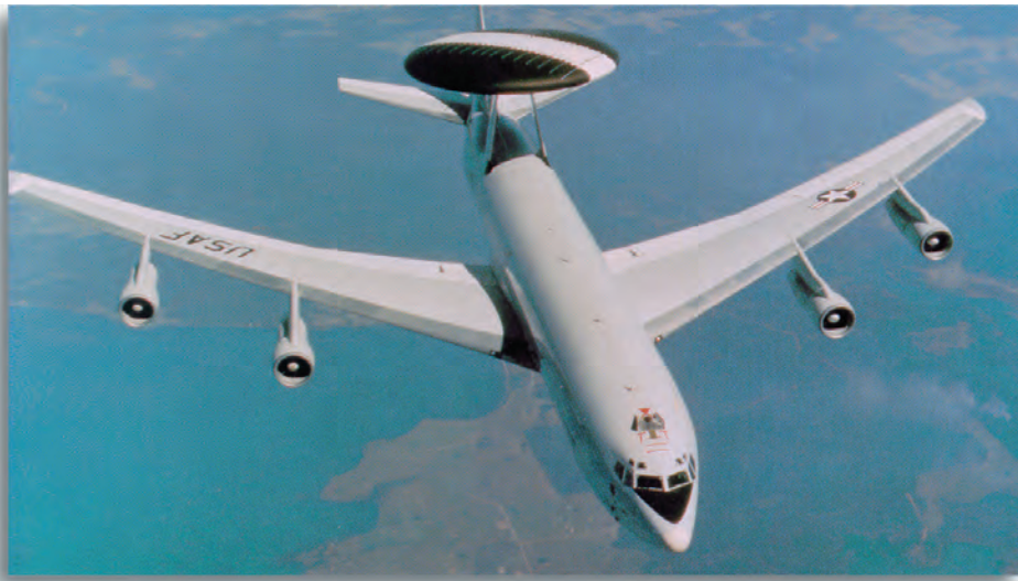
E-3A AWACS

E-4B. This is a version of the Boeing 747 jumbo jet. The E-4B serves as the National Airborne Operations Center for the National Command Authorities. In case of a national emergency, the aircraft provides a modern, highly survivable, command, control and communications center to direct US forces.