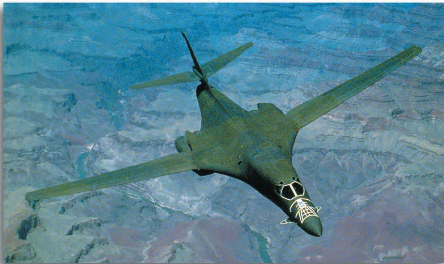
Rockwell International B-1B

B-1. In June 1977, President Jimmy Carter stopped production of the Rockwell B-1A supersonic bomber. In his decision, he called for a continuation of the B-1 research and development program. The Air Force wanted 244 of the B-1As as replacements for the B-52s. Their argument was that the B-52s were old and that the B-1 aircraft could penetrate enemy defenses better than the B-52. Opponents said the B-1s were too expensive (about $250 million each) and they were not needed because missiles could do the job better.