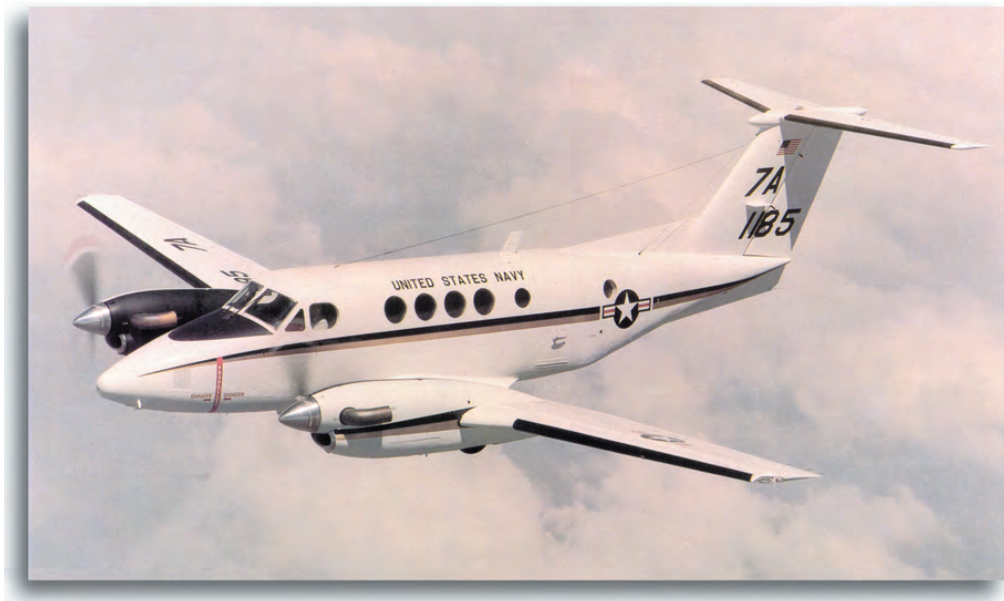
Beechcraft UC-12B

We have not included all military airplanes. In fact, we haven't included all of the military airplanes in any particular class. However, we have discussed the aircraft that are representative of military aircraft worldwide. In the next section, we will look at some special-use aircraft that do not fit into any of our categories.