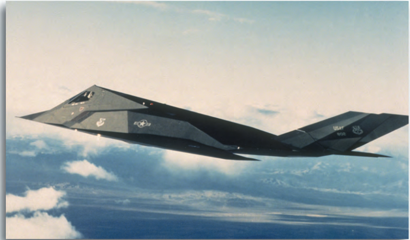
F-117 Blackjet (EAA)

F-14. The F-14 Tomcat is a supersonic, twin-engine, variable sweep wing, two-place fighter designed to attack and destroy enemy aircraft at night and in all weather conditions. Based on an aircraft carrier during normal patrols, it provides long-range air defense for the carrier battle group. The F-14 tracks up to 24 targets simultaneously with its advanced weapons control system and attacks six with Phoenix AIM-54A missiles while continuing to scan the airspace. Armament also includes a mix of other air-to-air missiles, rockets and bombs. The F-14 is able to achieve Mach 2 and climb to an altitude of over 50,000 feet.