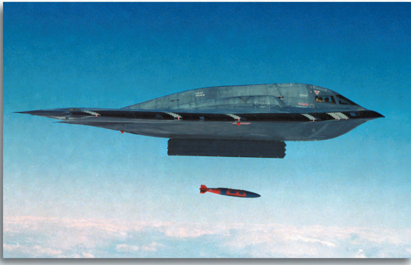
Northrop B-2

name “stealth.” It was developed to eventually replace the aging B-52 and compliment the B-1. It can carry a variety of conventional and nuclear weapons. The aircraft has a crew of two pilots. They share the workload with one pilot responsible for flying, while the other is bombing. An extremely capable and advanced aircraft, it is equipped with the latest in electronics technology. It was developed in almost complete secrecy and many of its advanced capabilities remain classified.