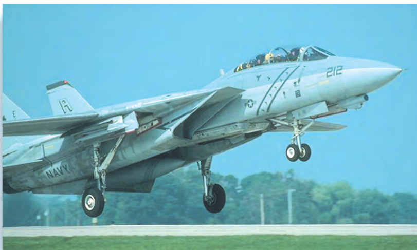
F-14 Tomcat (EAA)

F/A-18. The F/A-18 is an all-weather fighter and attack aircraft. The single-seat F/A-18 Hornet is the nation's first strike-fighter. It was designed for traditional strike applications such as interdiction and close air support without compromising its fighter capabilities. With its excellent fighter and self-defense capabilities, the F/A-18 at the same time increases strike mission survivability and supplements the F-14 in fleet air defense.