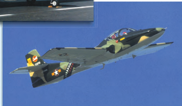
T-37 "Tweet" (EAA)

Navy pilots receive their basic training in the T-34C Turbo Mentor. This high-performance trainer is built by Beech Aircraft and carries an instructor and student in tandem. It is powered by a 550 horsepower turboprop engine and can fly over 300 mph. After basic training, the Navy pilot moves up to the jet-powered T-45 Goshawk. This primary jet training aircraft can fly at about 650 mph and is used to teach gunnery, bombing and how to operate from an aircraft carrier.