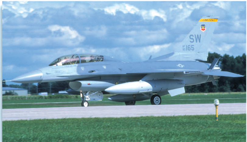
F-16 Fighting Falcon

The F-16 is a reversal of the US Air Force trend to produce large, heavy fighters. It weighs only 15,000 pounds empty compared to the F-15's empty weight of about 30,000 pounds. The F-16 is a Mach 2 aircraft with a range of 2,200 miles. In an air combat role, the F-16's maneuverability and combat radius (distance it can fly to enter air combat, stay, fight and return) exceed that of all potential threat fighter aircraft. It locates targets in all weather conditions and detects low-flying aircraft in radar ground clutter. In an air-to-surface role, the F-16 can fly more than 500 miles, deliver its weapons with superior accuracy, defend itself against enemy aircraft and return to its starting point. An all-weather capability allows it to accurately deliver ordnance during non-visual bombing conditions.