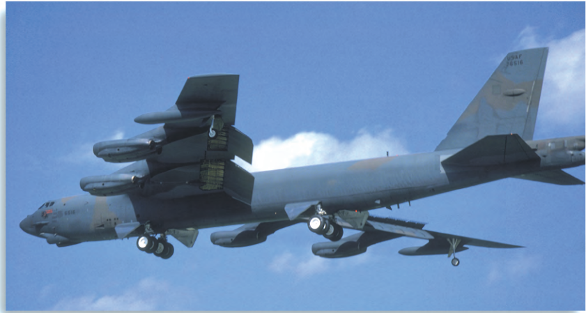
Boeing B-52 (EAA)

The B-52H is powered by eight turbofan engines that provide a speed of about 660 mph and a range of up to 10,000 miles. With aerial refueling, the B-52H can extend its range as much as necessary. The crew consists of a pilot, copilot, navigator, radar navigator and electronic countermeasure operator. It can carry nuclear or conventional bombs, and/or short-range attack missiles (SRAM) and air-launched cruise missiles (ALCM).