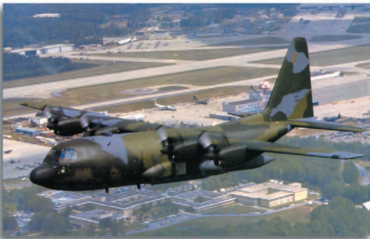
Lockheed C-130 Hercules

C-130 Hercules. Like the C-5 and the C-141, the Hercules is built by the Lockheed-Georgia Company. The Hercules is much smaller than the C-5 or the C-141 and is turboprop-powered rather than turbojet-powered. However, the C-130 has to be considered one of the most successful aircraft of all times. The C-130 is also one of the most highly modified of all airplanes. Over thirty models have been produced and are used by 52 foreign countries and by the US Air Force, Navy, Marine Corps and Coast Guard. It is used as a transport, a tanker, a gunship and a reconnaissance aircraft. It is also used for search and rescue, communications, weather observation and to launch drones (unmanned aircraft). The C-130 has a cruising speed of about 350 mph and can carry up to 92 troops or 45,000 pounds of cargo.