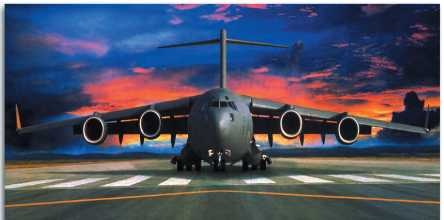
C-17 Globemaster III

C-17. The C-17 Globemaster III is the newest, most flexible cargo aircraft to enter the airlift force.