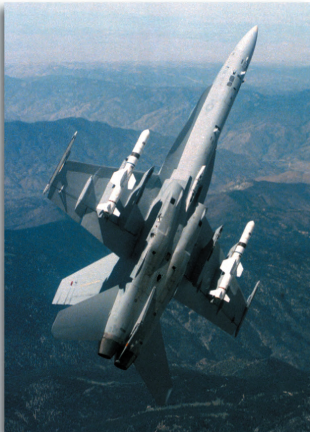
F/A-18 Hornet

fighter mode, the F/A-18 is used primarily as a fighter escort and for fleet air defense; in its attack mode, it is used for force projection, interdiction, and close and deep air support.