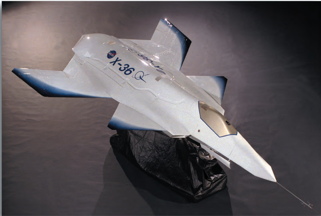
Boeing X-36 Unmanned Tailless Agility Research Aircraft