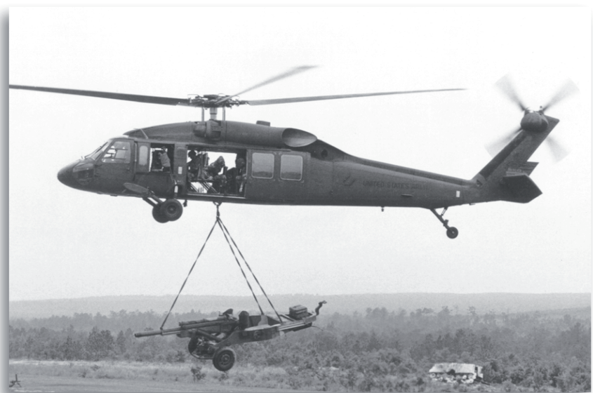
UH-60A Black Hawk

UH-60. Although developed as a replacement for the UH-