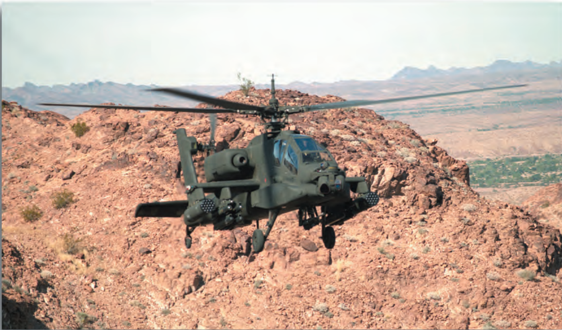
AH-64A Apache

Both aircraft can carry an assortment of weapons ranging from the Hellfire missiles to the 2.75 in rockets. The AH-64 has a 30mm gun; the Cobra has a three-barreled 20mm cannon.