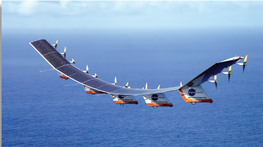
The Helios Prootype flying wing is shown over the Pacific Ocean during its first test flight on solar power rom the U./S. Navy's Pacific Missile Range Facility in Hawaii

RQ-4. The Northrop Grumman RQ-4 Global Hawk is powered by a Rolls-Royce/Allison F-137 turbofan. The airframe has prominent nose bulge houses a wideband SATCOM antenna. . The vehicle can reach an altitude of 65000 feet and has an endurance of 40 hours. It is about the size of a U-2.