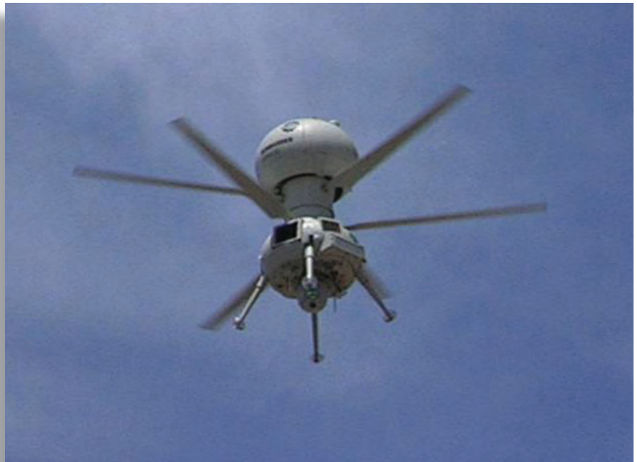
CL 327

One of the first to appear was the RQ-2 Pioneer . It was developed by IAI in Israel; then further developed in the US. It has operated from land bases as well as ships. On ships it operated from the battleships and later from Navy LPD-type ships. LPDs are landing ships for personnel and include a well deck to operate landing craft or hovercraft. The Pioneer is presently operated by the US Marine Corps.