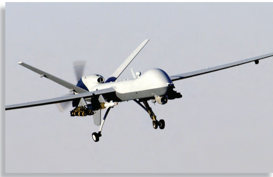
MQ-9 Reaper

In the medium size class is the General Atomics RQ-1 Predator . Recently an armed variant, the MQ-9 Reaper has also appeared. In the rotary wing world, the RQ-8A and RQ-8B Firescout operated by Army and Navy have appeared. They are base on the Hughes 269 manned helicopter. The Eagle Eye is a Tilt Rotor UAV presently being explored by the Coast Guard. The Northrop Grumman RQ-5