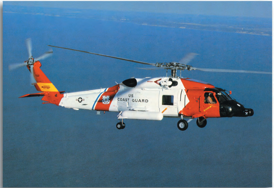
Coast Guard HH-60J

1. The Blackhawk spans the space between utility and medium lift. First developed by Sikorsky as the UH-60 Blackhawk , versions are now in use by all services and many foreign countries. The US Army operates the UH-60 Blackhawk ; the US Navy operates the SH-60B, SH-60F, MH-60R, HH-60H, MH-60S; the US Coast Guard operates the MH-60J, the US Marine Corps operates the VH-60N to transport the President and the US Air Force operates the MH-60G. All H-60