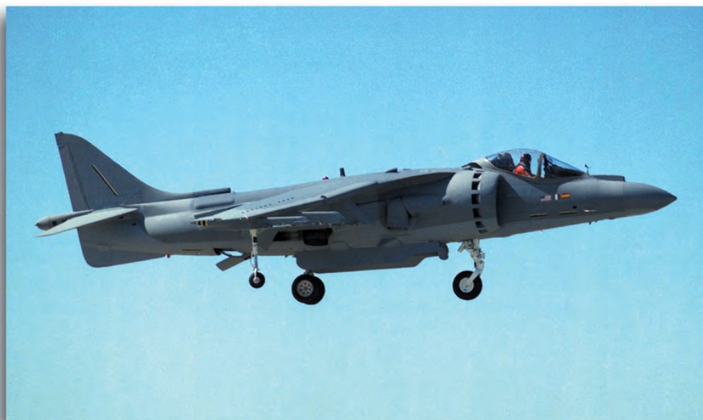
AV-8 Harrier

some were lost to ground fire not a single one was lost in air-to-air combat. The US Marine Corps initially ordered the AV-8A Harrier then the AV-8B Harrier II . The AV-8B makes larger use of composites and has a larger wing. The British have continued to develop the Harrier into the GR9.