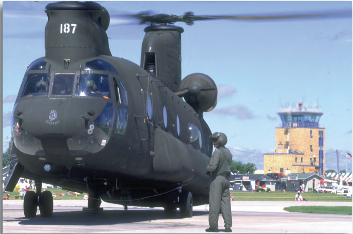
Boeing CH-47 Chinook (EAA)

length is 99 feet. It is an outgrowth of the earlier CH-53D Sea Stallion which is still operated by the US Marines. The CH-53D has two engines each with 3200 SHP. The CH-53D has a six-bladed main rotor with a diameter of 72 feet. A replacement for CH-53E is currently under development, it is the CH-53K.